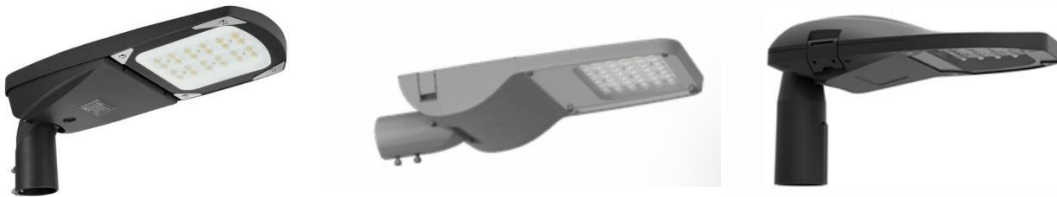
Figure 7.1 Typical Dark Sky Compliant Lanterns

Street lighting will be provided in the form of column mounted LED lanterns similar to those detailed below. Lanterns will be pointed into the development and away from the adjacent sites. Lantern optics will control the distribution of light avoiding overspill, sky glow and glare. If required, street lighting will be provided with timeclock controls enabling switching off of fittings which will reduce the night time effect of the lighting installation on the surrounding environment.