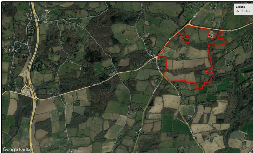
Figure 1.1: Site Location