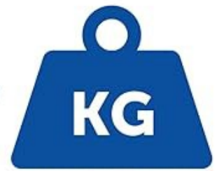
TABLE WEIGHS 4.5KG