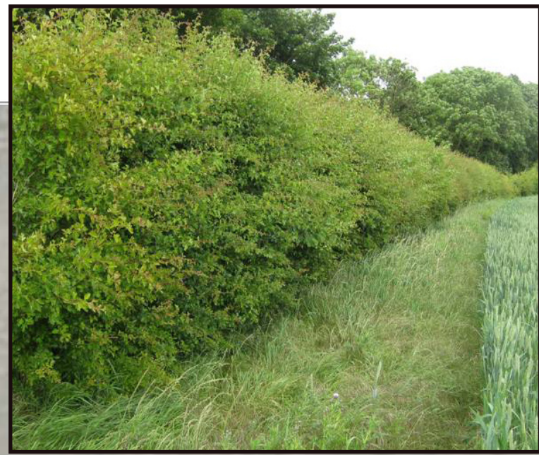
A native mixed species hedge five years after planting