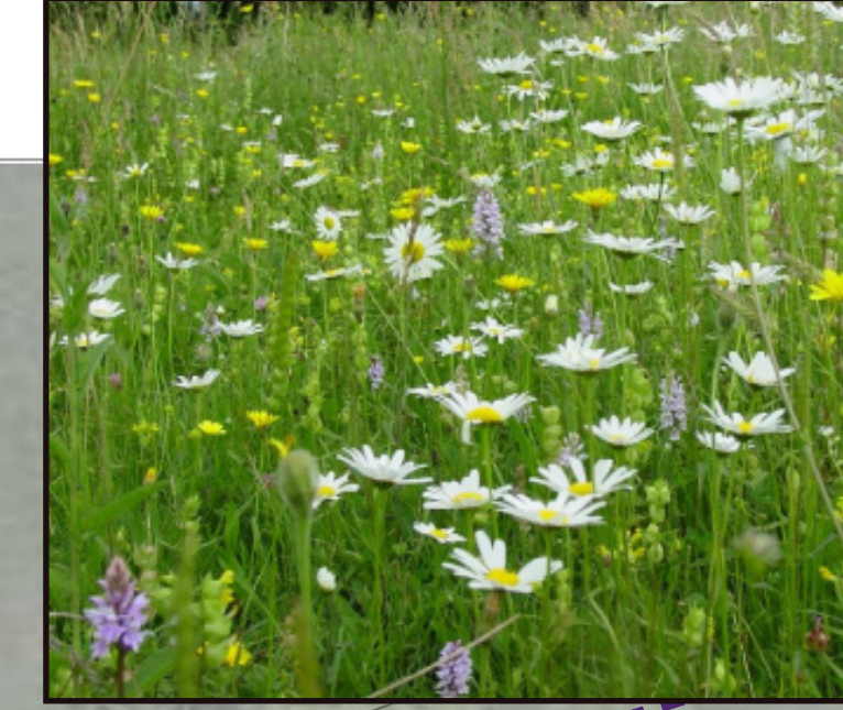
UK Provenance Native Wildflower Grassland