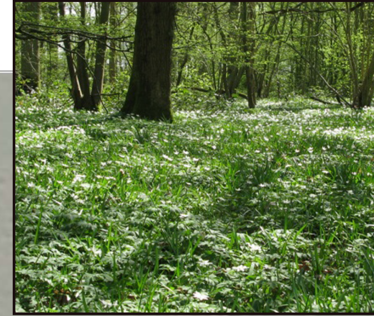
Woodland floor / woodland edge habitat