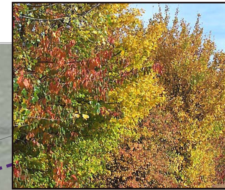
Native mixed species hedgerow and understorey shrubs

Existing boundary trees to be retained and protected on site in accordance with BS 5837: 2012 - 'Trees in Relation to Design, Demolition and Construction - Recommendations'.