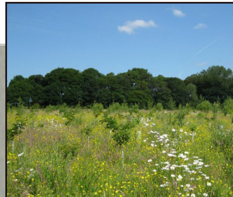
Native species woodland with wildflower grassland