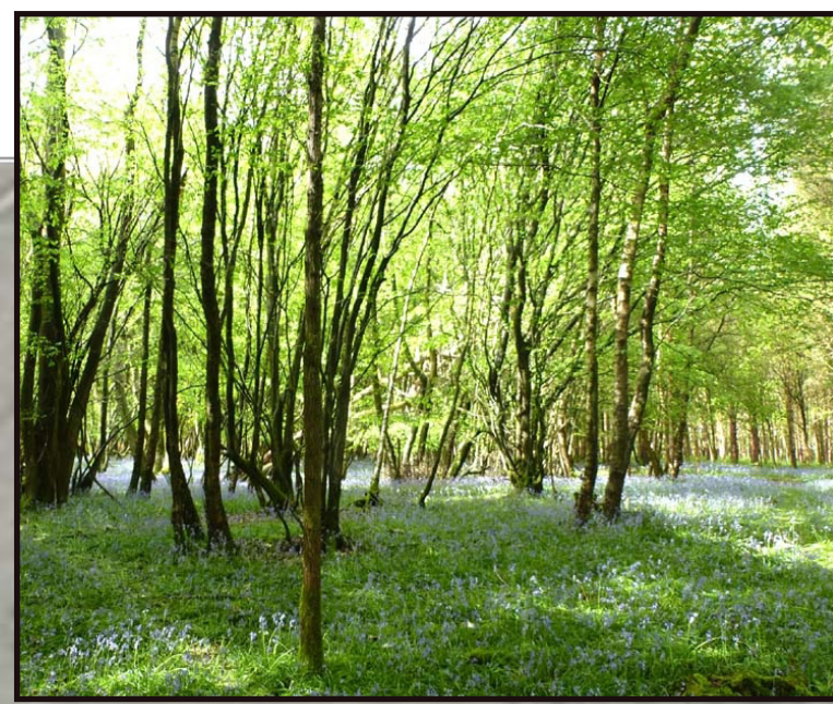
Developing deciduous native species woodland habitat