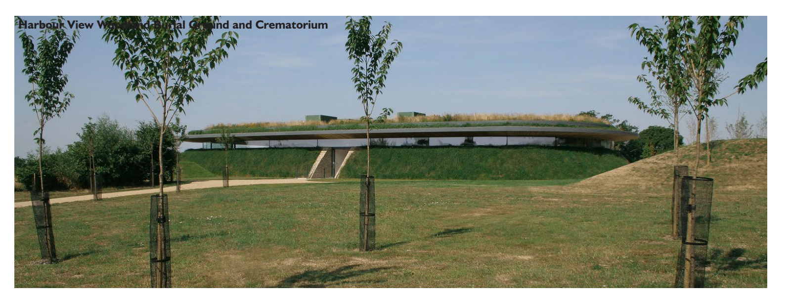
917-IM-01 - April 2021