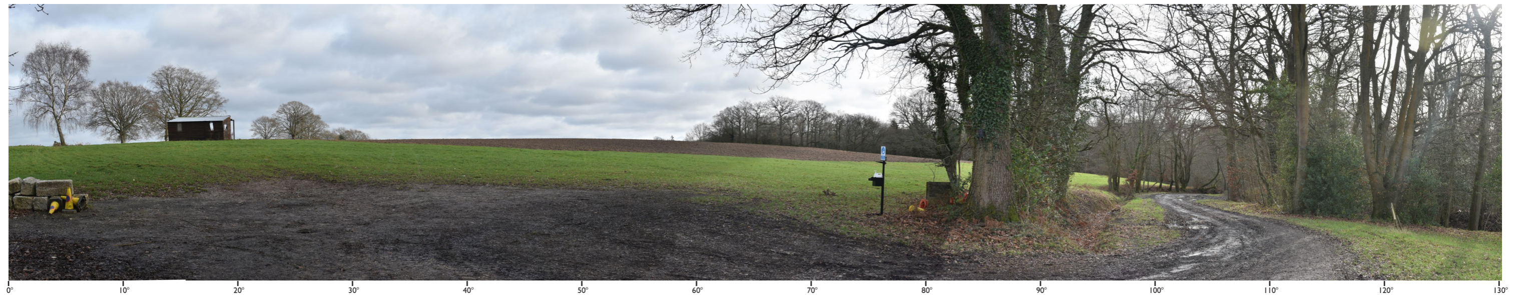
Winter - 17th January 2021, 14:10