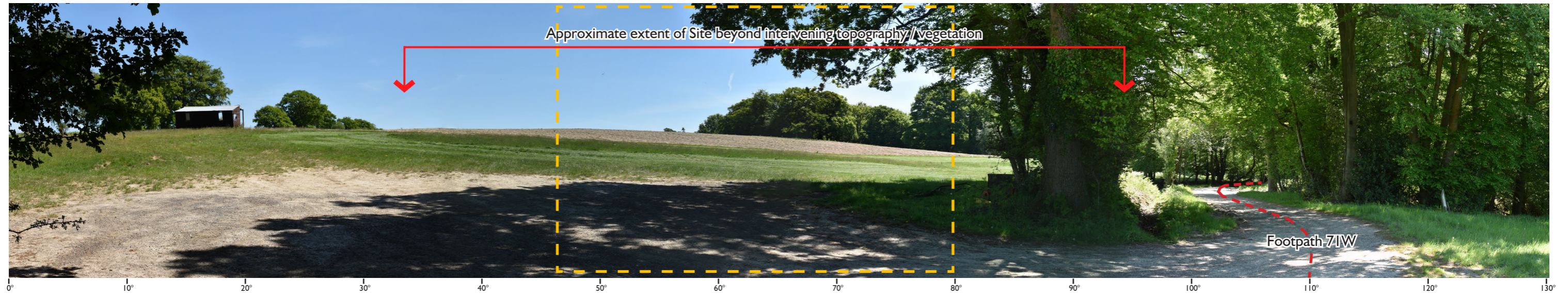
Summer - 19th May 2020, 12:32