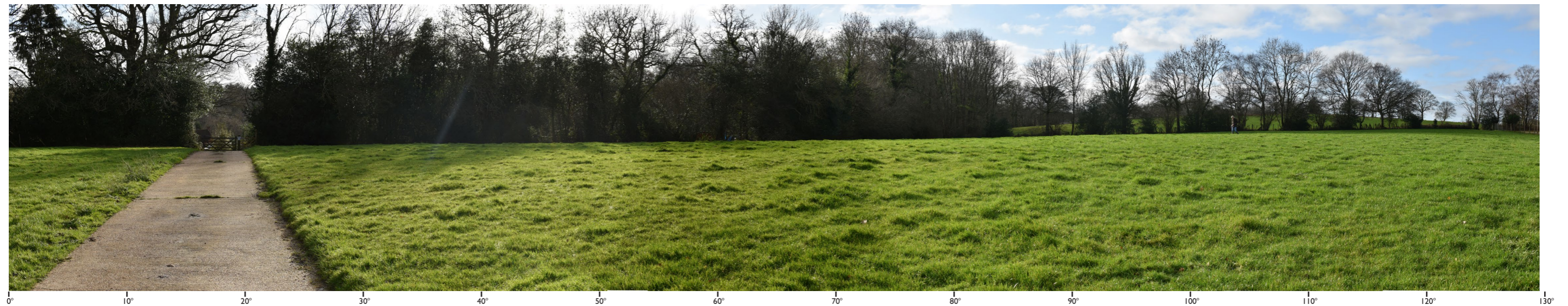
Winter - 17th January 2021, 11:49

Panoramic view looking south from the access track to the Turners Hill reservoir (the track runs between 'Miswells Cottages' and 'Miswells House').