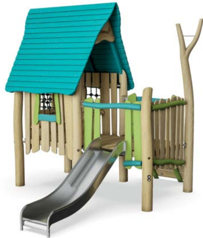
Small play house and slide