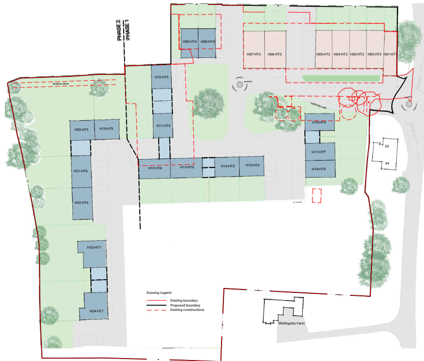
02 Option 2 - 27.01.2020 SCALE 1:1500