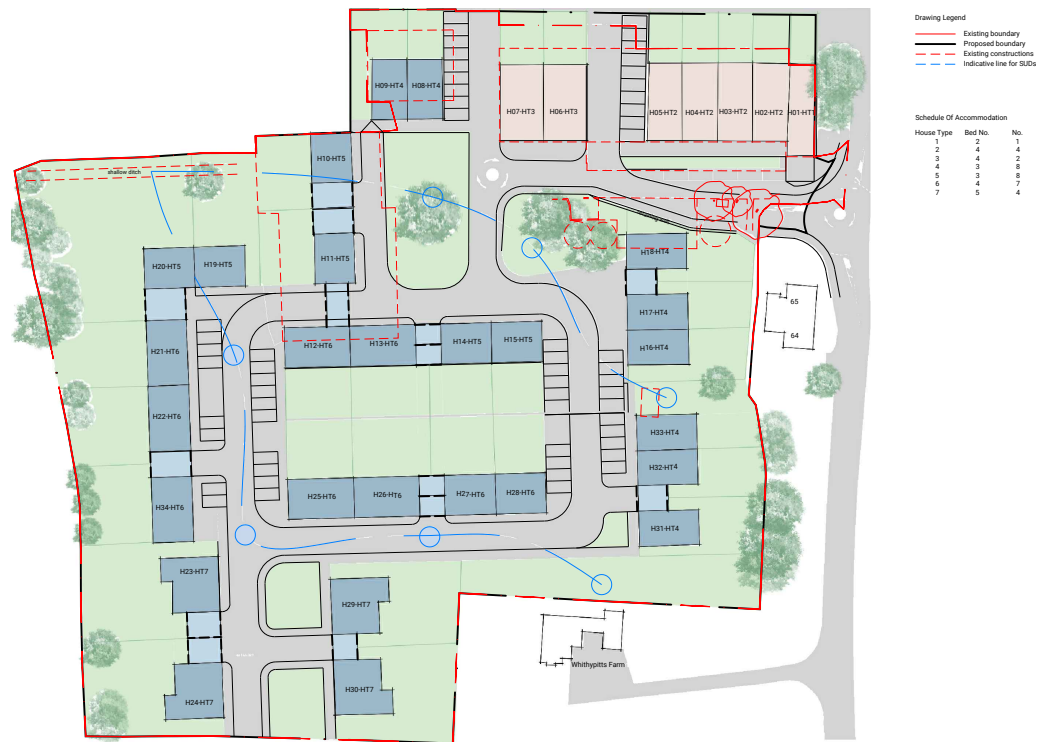
03 Option 3 - 07.02.2020 SCALE 1:1500