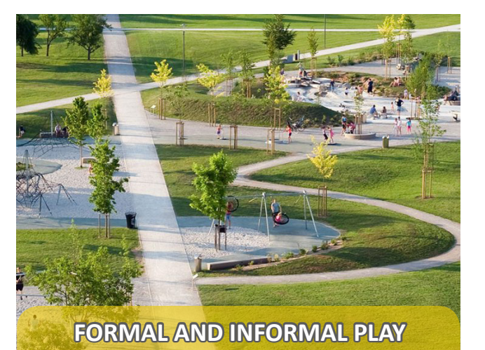
• LOCATING FORMAL PLAY BY THE COMMUNITY CENTRE