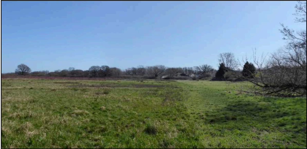
Figure 2: View Over LGS1 Demonstrating the Proximity of the Land to the Settlement Edge