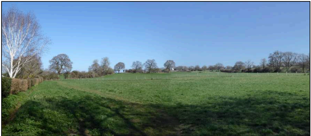
Figure 5: View Over the Eastern Field Proposed for Removal from LGS4