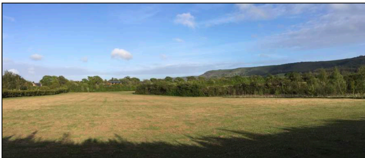
Figure 6: Downlands Community Field (LGS5)