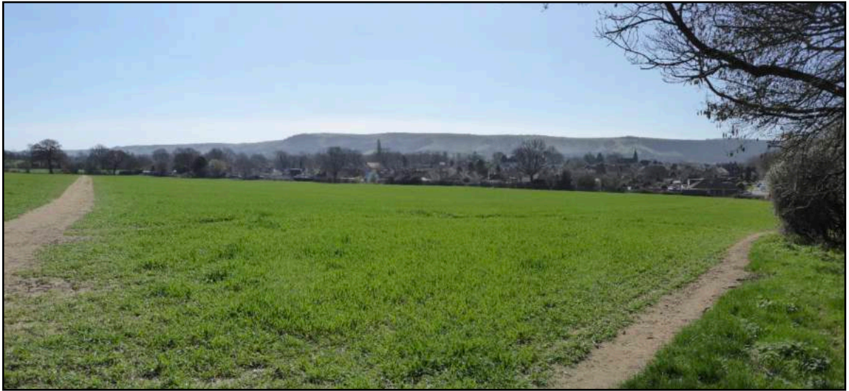
Figure 4: View Over the Western Field to LGS4 Demonstrating the Proximity of the Land to the