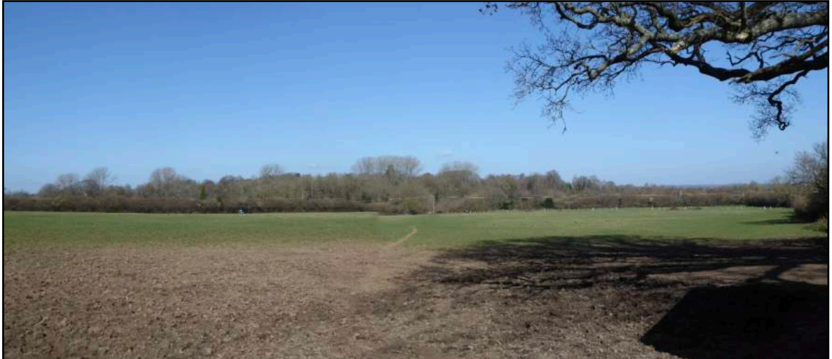
Figure 3: General View Over LGS2