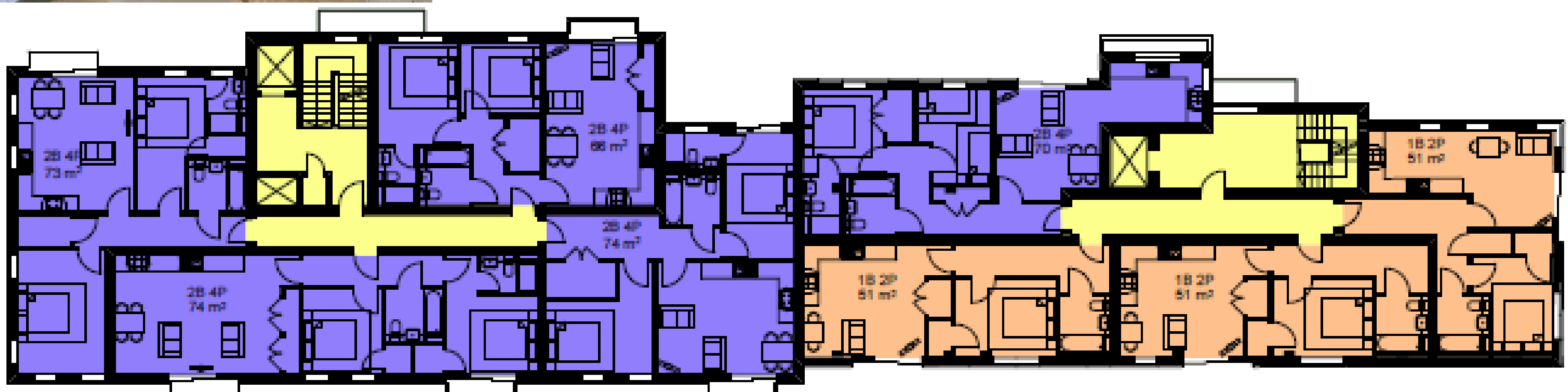
First and Second Floor