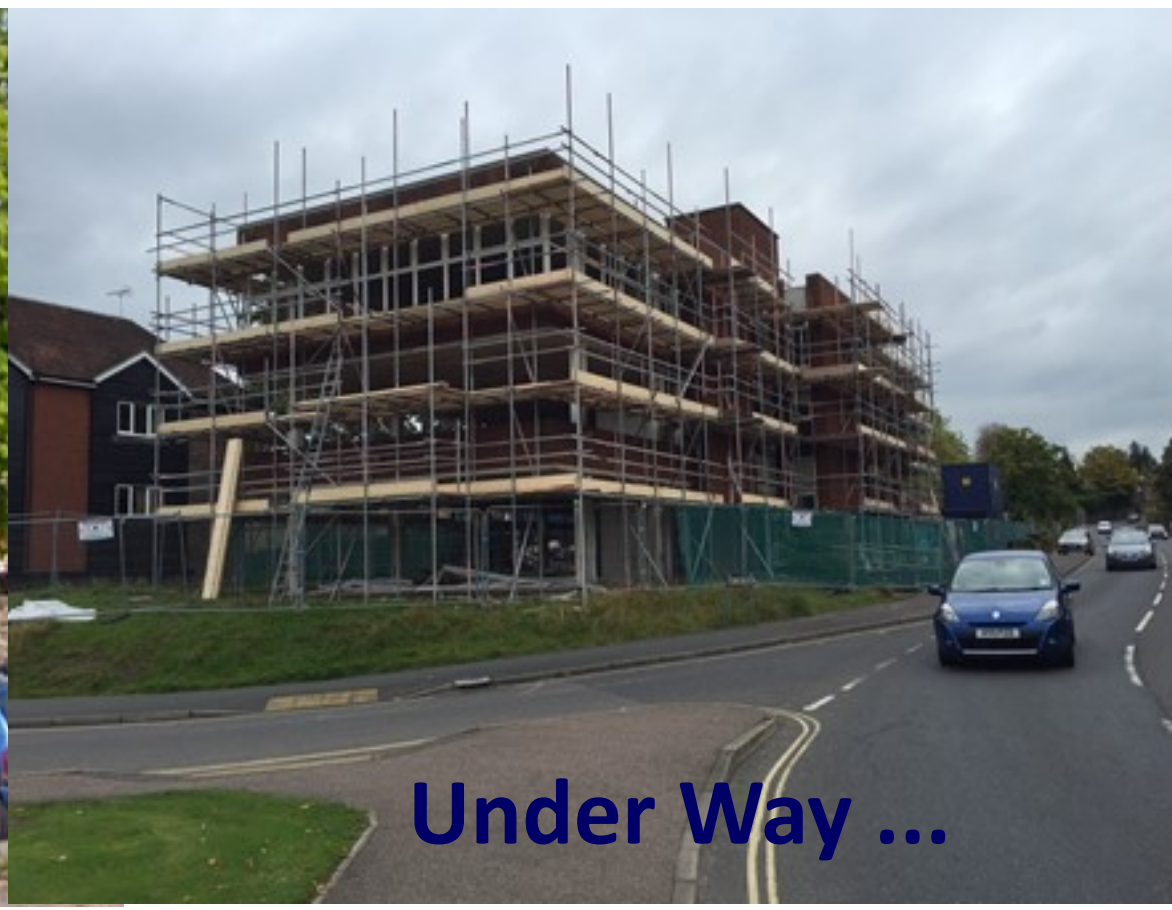
Under Way ...