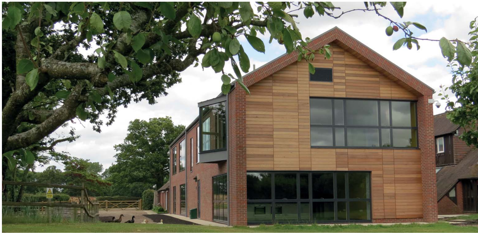
View towards the Duck Pond