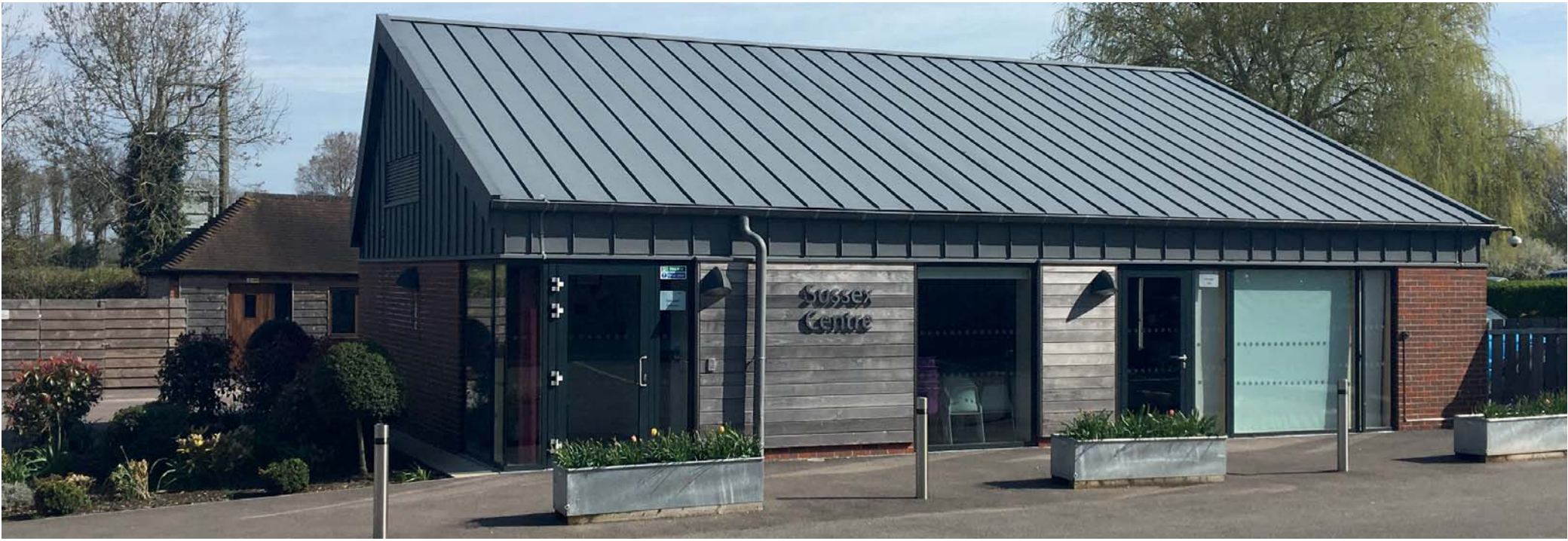
From the Courtyard