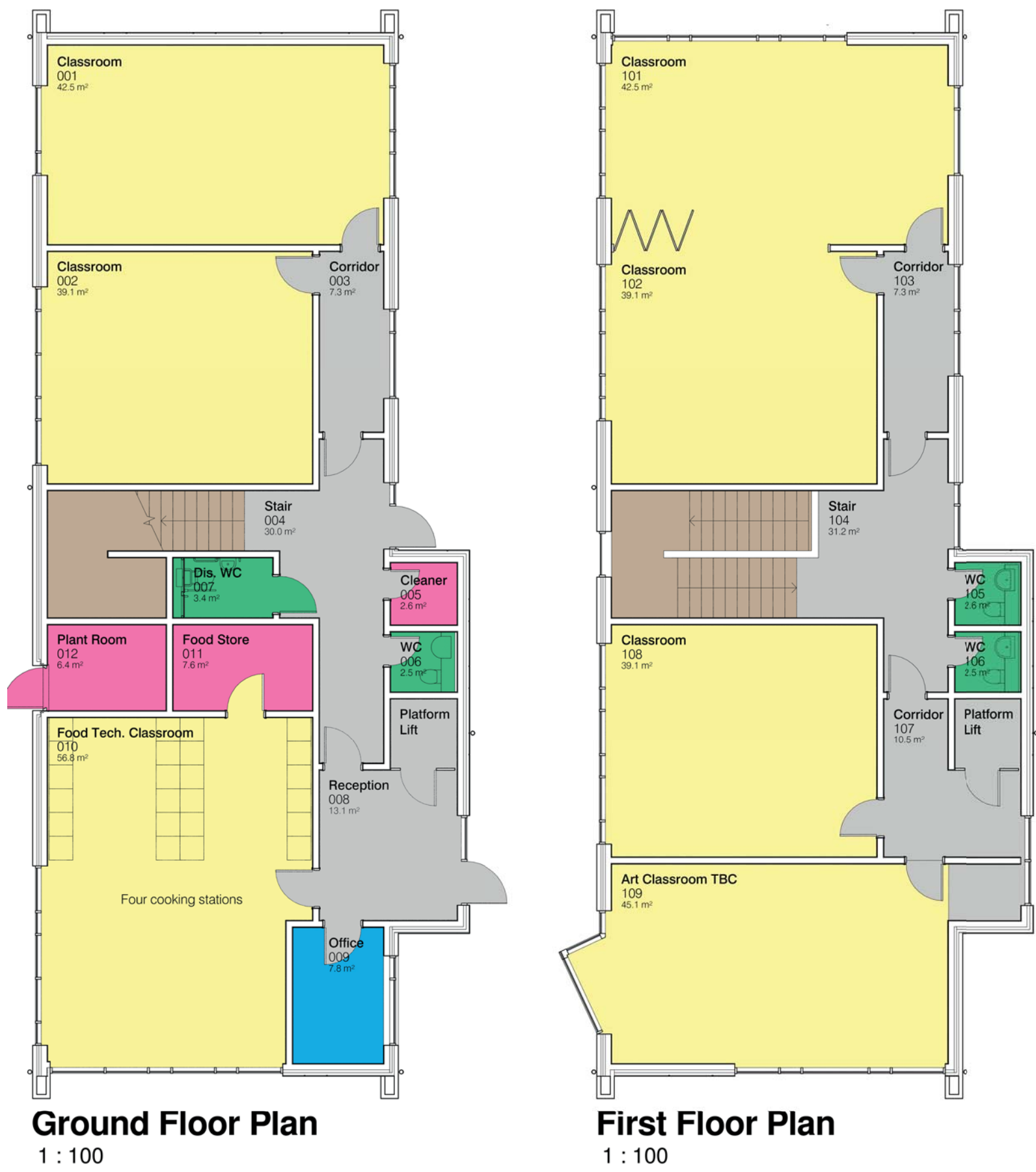
Ground Floor Plan 1 : 100