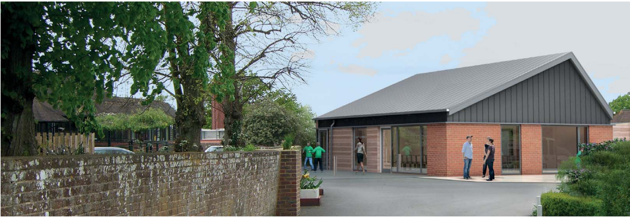
From the Drive