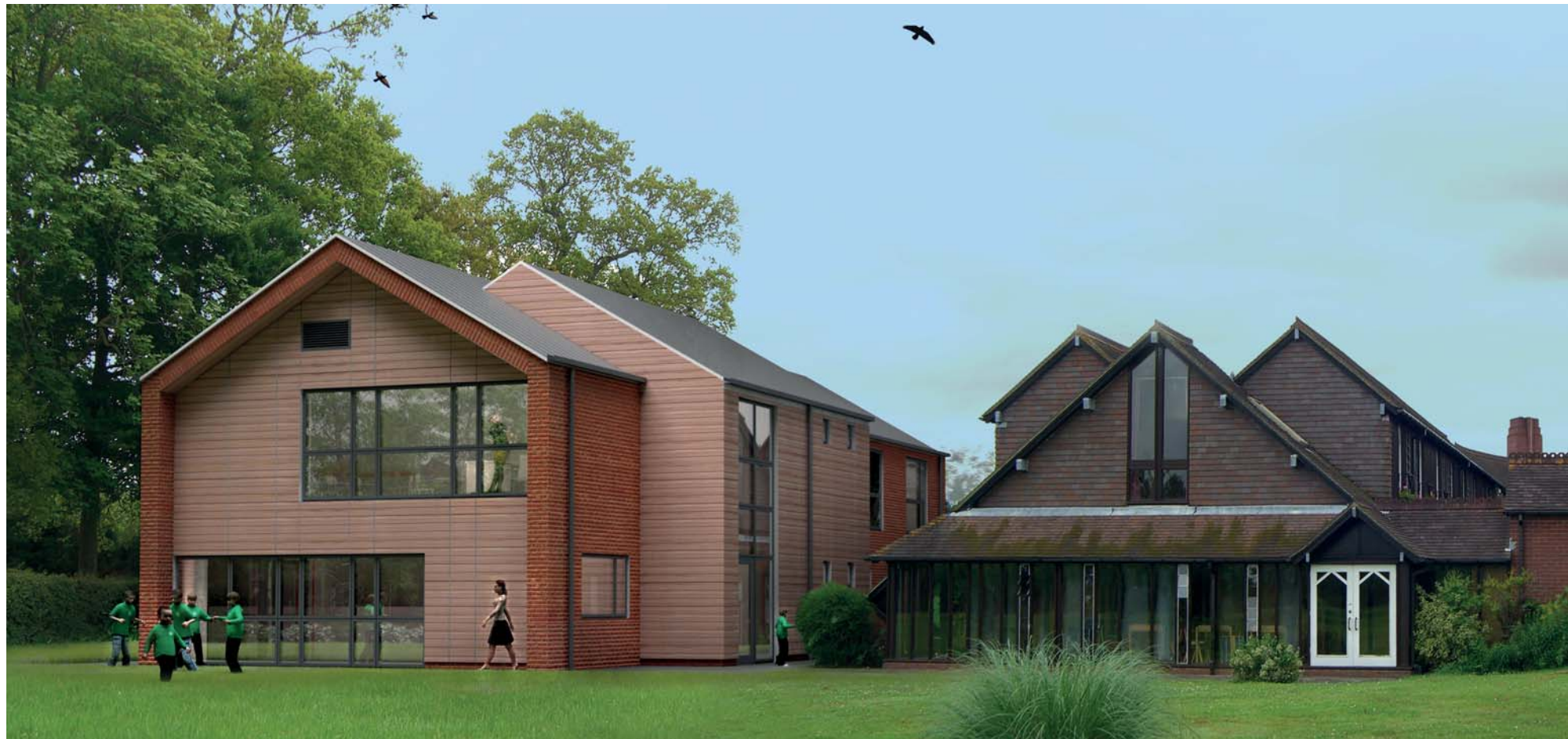
View from The Orchard