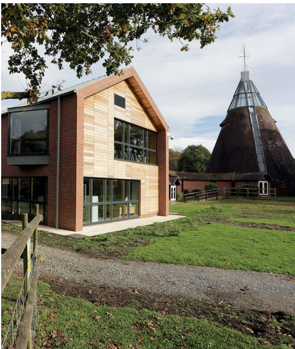
View of the South Gable