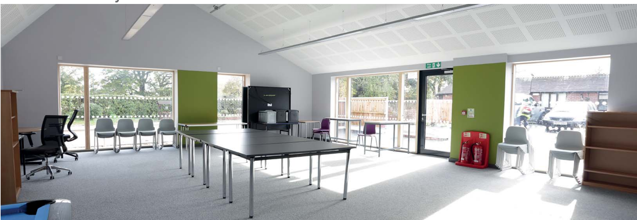
The Common Room