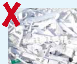
Shredded paper (you can compost it or put it in the blue paper banks at local recycling bring sites)