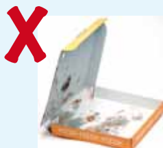
Food soiled paper and card