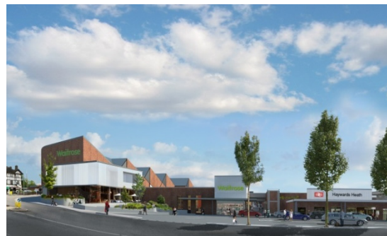
Station Quarter (artist impression)

3.9 A scheme is being implemented to redevelop the existing railway station quarter. This will deliver a number of jobs as well as help regenerate the area. The scheme also involves safeguarding sufficient land to allow for the Bluebell railway to gain access to the station and thereby create a major tourist facility within the town. This is anticipated in 10-15 years.