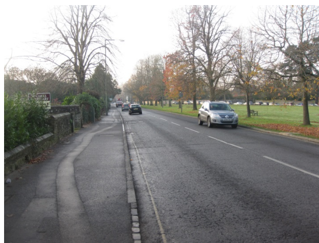
Muster Green South (A272)