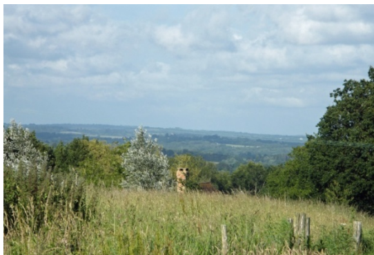
View from Millennium Woodland view to North / North East towards High Weald AONB