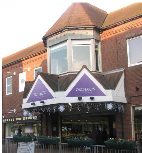
Orchards Shopping Centre