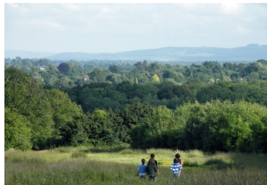
View from Millennium Woodland (looking South towards Blunts Wood, Paiges Wood)

2.10 South Road is the main shopping area and on the north side of the road is The Orchards Shopping Centre, which offers a pedestrian precinct with many shops, including branches of multi-nationals.