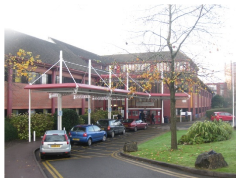
Princess Royal Hospital

2.12 The Town is served by three bus companies that offer services both in the Town and to the surrounding Towns of Brighton, Lewes, Uckfield, Burgess Hill, Horsham and Crawley and the adjoining rural areas. The main bus interchange is located close to the Railway Station and there are frequent services running to and from the Princess Royal Hospital. These services have been enhanced by the roll out of real-time digital information at key points around the Town. HHTC facilitates a Transport