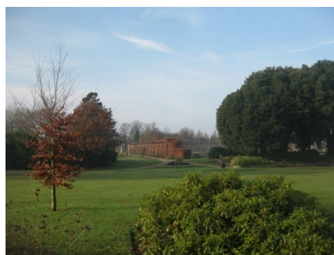
Beech Hurst Gardens