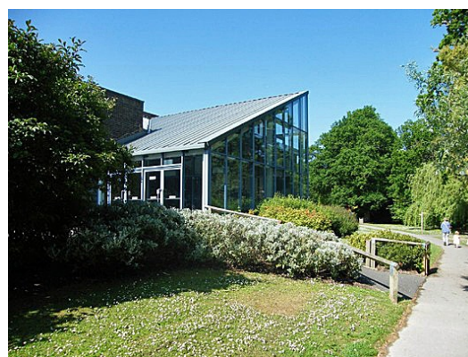
The Dolphin Leisure Centre