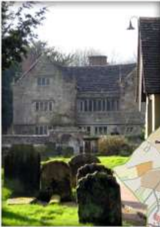
Manor House from St Margaret's Church, West Hoathly