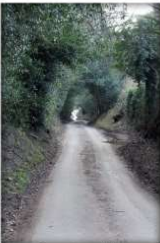
Green tunnel along Cob Lane