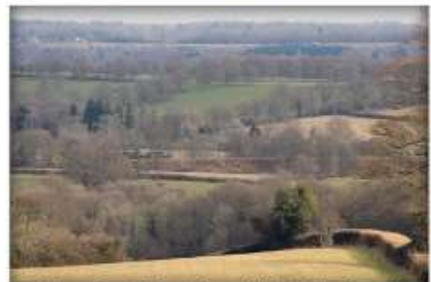
View South-East from All Saint's Church, Highbrook with Bluebell Railway