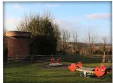
Sharpthorne playground, railway tunnel airvent and views North